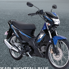
PEARL NIGHTFALL BLUE