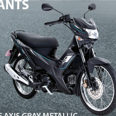
MATTE AXIS GRAY METALLIC