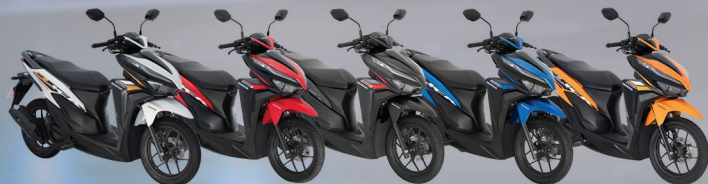
Matte Pearl Crater White