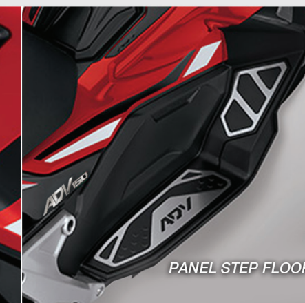
PANEL STEP FLOOR