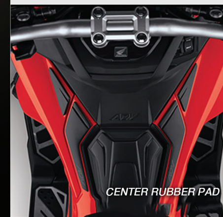
CENTER RUBBER PAD