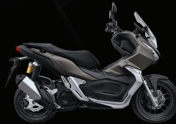
Matte Meteorite Brown Metallic