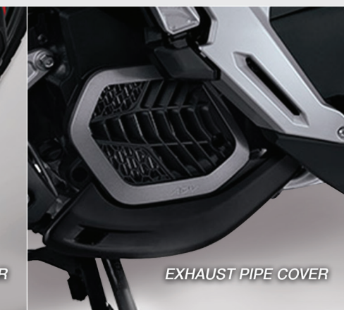
EXHAUST PIPE COVER