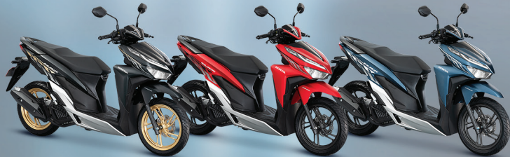
Matte Gunpowder Black Metallic