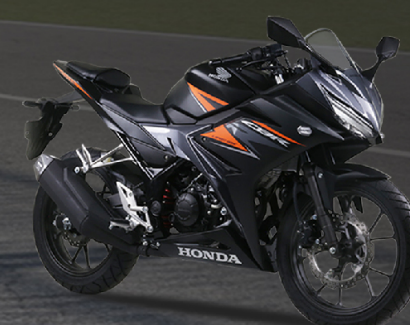
Matte Gunpowder Black Metallic