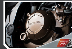
POWERFUL 150CC 6-SPEED DOHC LIQUID-COOLED ENGINE Born out of MotoGP DNA, Honda presents the latest generation of world class racing engine.