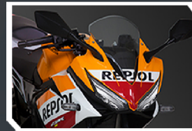
NEW VISOR AND FRONT COVER More aggressive and sporty look.