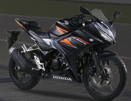
Matte Gunpowder Black Metallic