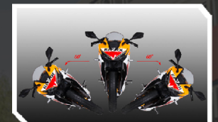
BANK ANGLE SENSOR Built-in safety feature that automatically turns off the engine when your bank angle exceeds 60° on either sides.