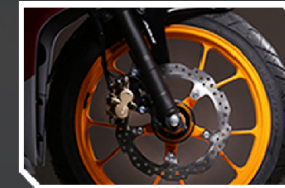
NEW WAVY DISC BRAKE Gives more style and edge on the road.