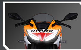
FULL LED LIGHTING SYSTEM Increase visibility on the road with the twin LED headlight design.