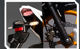
NEW ANTI-LOCK BRAKING SYSTEM (ABS) + NEW EMERGENCY STOP SIGNAL (ESS) The new ABS feature provides a more stable braking system to prevent wheels from locking during sudden brake or slippery road conditions; while the new ESS feature automatically blinks the hazard light to give early warning to drivers behind when sudden stop occurs.