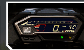
NEW DIGITAL PANEL Sporty and full digital meter panel enhanced with blue background.